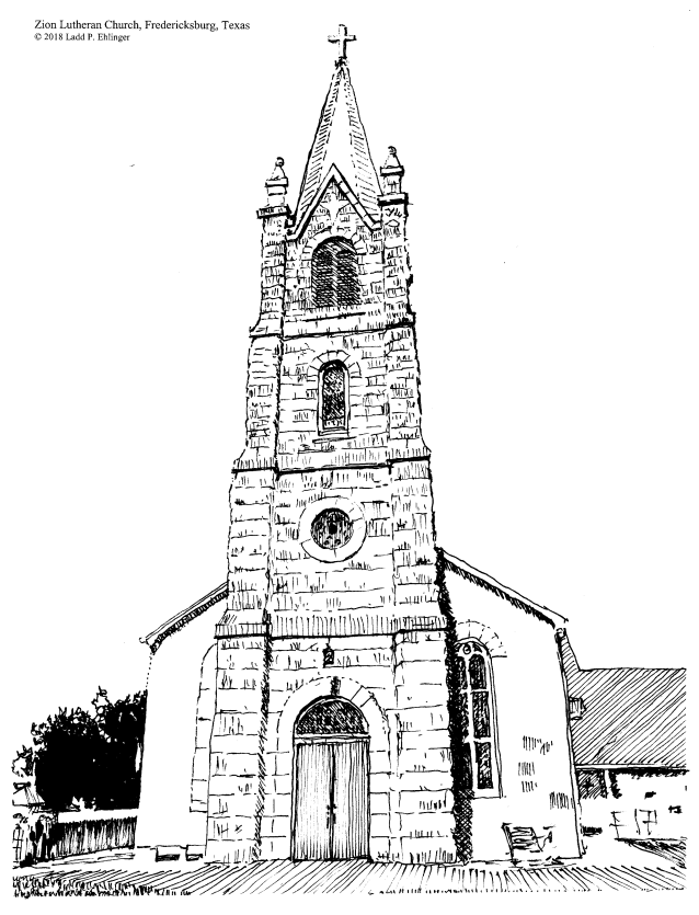
Zion Lutheran Church

The church contains a Thorwaldsen statue of Jesus Christ which was installed in the chancel in 1908. The stained glass windows in the nave all have special meanings in the Christian tradition of using the stained glass for catechism: the Advent Window commemorates the arrival of Christ in Jerusalem on Palm Sunday, and the Christmas Window signifies the humanity of Christ in his humble birth on